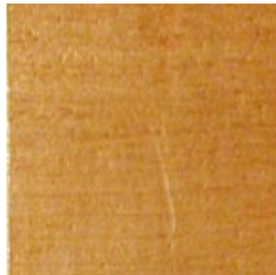
Natural maple with laquer