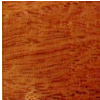
Natural Mahogany with oiled finish