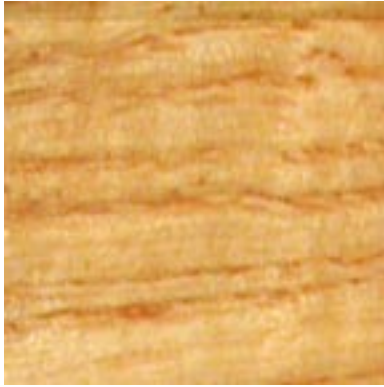
Natural Ash with oiled finish