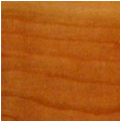
Natural Cherry with oiled finish